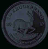
2017 1/4oz Proof Gold (22mm)