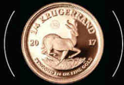
2017 1/4oz Proof Gold (22mm)