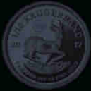
2017 1/10oz Proof Gold (16.5mm)