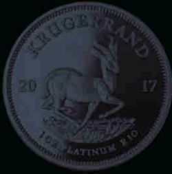
2017 1oz Proof Platinum (32.69mm)