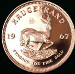
1967 1oz Vintage Proof (32.69mm)