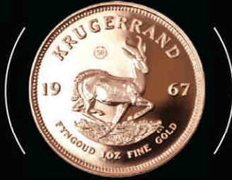
1967 1oz Vintage Proof (32.69mm)