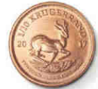
2017 1/10 OZ BULLION REVERSE 16.5MM