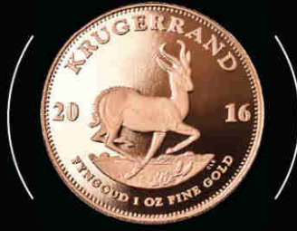
2016 1oz Proof Gold (32.69mm)