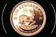
2017 1/10oz Proof Gold (16.5mm)