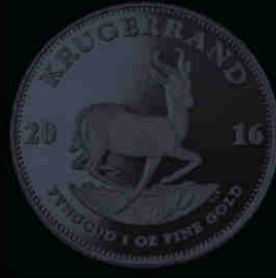
2016 1oz Proof Gold (32.69mm)