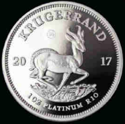
2017 1oz Proof Platinum (32.69mm)