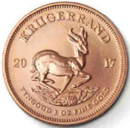
2017 1 OZ BULLION REVERSE 32.69MM