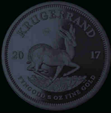
2017 5oz Proof Gold (50mm)