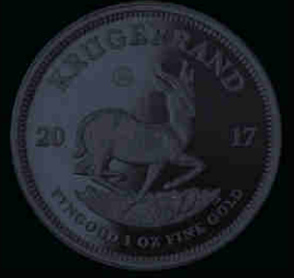
2017 1oz Proof Gold (32.69mm)