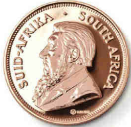
GOLD PROOF COINS