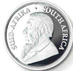
2017 1 OZ SILVER PROOF COIN