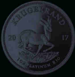
2017 1oz Proof Platinum (32.69mm)