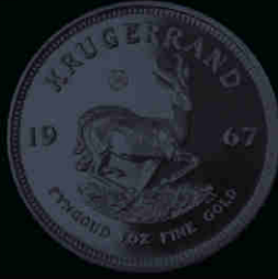
1967 1oz Vintage Proof (32.69mm)