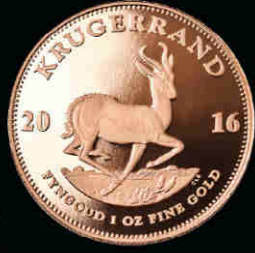
2016 1oz Proof Gold (32.69mm)