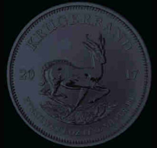
2017 1oz Premium Silver (38.725mm) Uncirculated