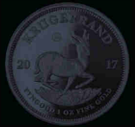
2017 1oz Proof Gold (32.69mm)