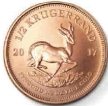
2017 1/2 OZ BULLION REVERSE 27MM