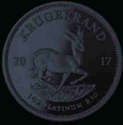
2017 1oz Proof Platinum (32.69mm)