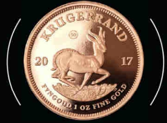
2017 1oz Proof Gold (32.69mm)