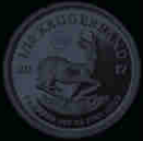
2017 1/10oz Proof Gold (16.5mm)