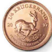
2017 1/4 OZ BULLION REVERSE 22MM