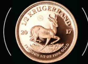
2017 1/2oz Proof Gold (27mm)