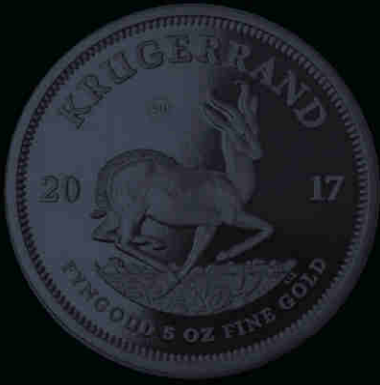
2017 5oz Proof Gold (50mm)