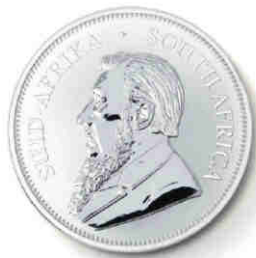
2017 1 OZ SILVER PREMIUM UNCIRCULATED COIN