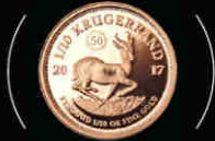
2017 1/10oz Proof Gold (16.5mm)