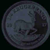
2017 1/4oz Proof Gold (22mm)