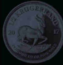
2017 1/2oz Proof Gold (27mm)