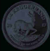
2017 1/4oz Gold (22mm) Proof