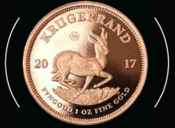
2017 1oz Proof Gold (32.69mm)