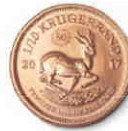
LIMITED EDITION WORLD MONEY FAIR 2017 1/10 OZ REVERSE 16.5MM

We present the 2017 Krugerrand gold bullion range above, consisting of the traditional 1 oz, 1/2 oz, 1/4 oz and 1/10 oz coins, as well as the limited edition World Money Fair 2017 1/10 oz coins bearing the official 50th anniversary mint mark.