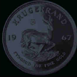
1967 1oz Vintage Proof (32.69mm)