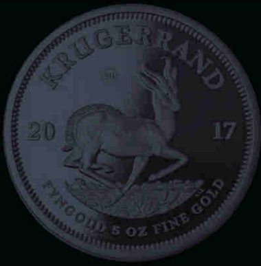
2017 5oz Proof Gold (50mm)