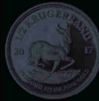
2017 1/2oz Proof Gold (27mm)