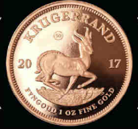
2017 1oz Proof Gold (32.69mm)