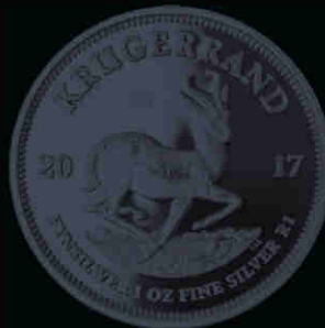
2017 1oz Proof Silver (38.725mm)