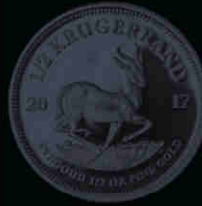
2017 1/2oz Proof Gold (27mm)