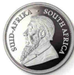
2017 1 OZ PLATINUM PROOF COIN