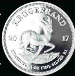
2017 1oz Proof Silver (38.725mm)