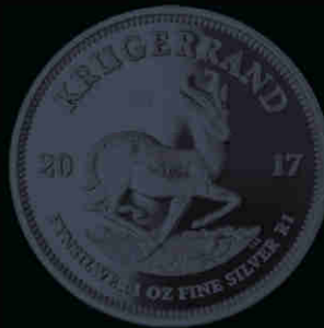
2017 1oz Proof Silver (38.725mm)